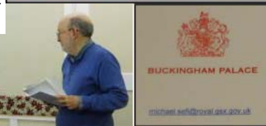
Buckingham Palace postal meter cancel above; Buckingham Palace letterhead below.