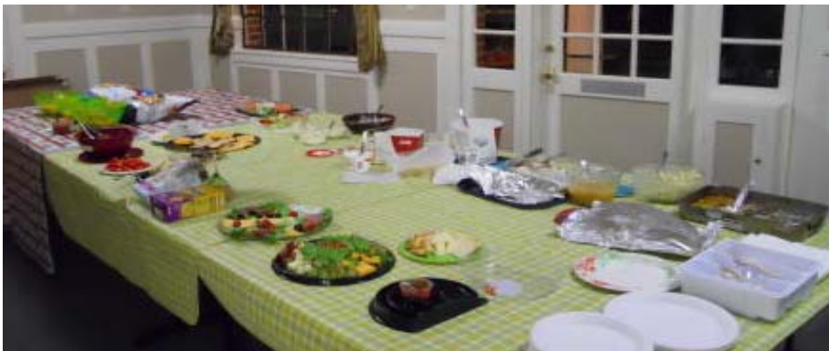
An early (and incomplete) view of the main dishes - more arrived before dining commenced. There were so many desert dishes, they covered a main room table.

Another very Merry Christmas Party with more than 30 club members, family and friends. We have some of the best unplanned potlucks around - and this year was no exception. No one went home hungry - the desert dishes were great.