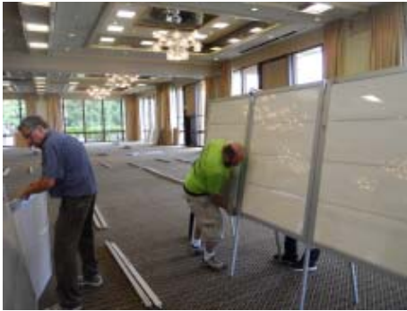
THE SET UP OF 120 FRAMES WAS VERY SMOOTH, THANKS TO ORLIE TRIER, RANDY HOWE & OTHERS.