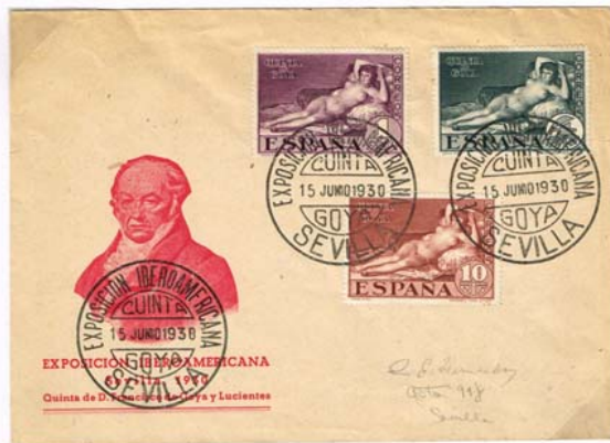
First Day Cover of Spain's Goya Nudes Issue June 15 1930 Spanish -American Exposition Seville Spain Issued to Commemorate the 100th Anniversary of the Death of Francisco de Goya y Lucientes Image is after his painting: La Maja Desnuda

So in addition to being our COTM, it is also part of our series on Exhibit pages.