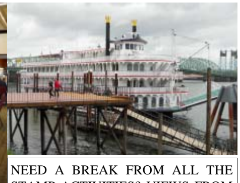
NEED A BREAK FROM ALL THE STAMP ACTIVITIES? VIEWS FROM THE PANORAMA WINDOWS INCLUDED THE QUEEN OF THE WEST STERNWHEELER.